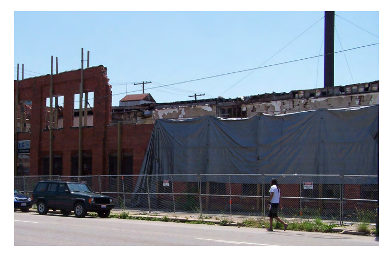
Main Manufacturing Building of the Former B & T Metals Facility (2006 photo)

No monitoring, maintenance, or site inspections are required for the Columbus East site. LM's responsibilities consist of managing site records and responding to stakeholder inquiries.